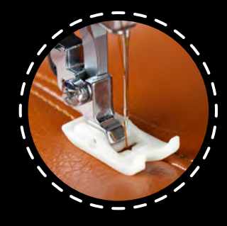
5 mm LEATHER